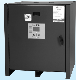
REGF Shown with Megatrac™ option

Compliances: FAA AC 150/5345-10: L-828 ICAO Aerodrome Design Manual, Part 5