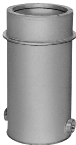
2424 L-868, Class I, Size B Light Base