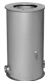
2124 L-867, Class I, Size B Light Base