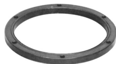
5402 L-868 Flange Ring with O-Ring